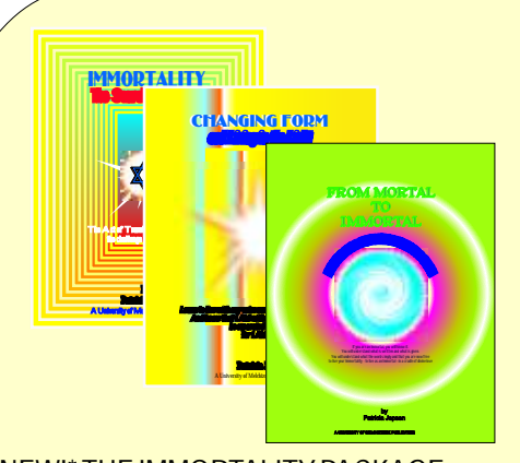
*NEW!* THE IMMORTALITY PACKAGE