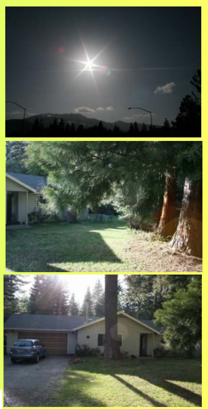
Photographs of the new center for the University of Melchizedek at Mt. Shasta

The Blessings of The Melchizedek Council and Our Lord Sananda is once again beaming out to all life from Mt. Shasta as the University of Melchizedek is finally relocated to the sacred mountain located in California.