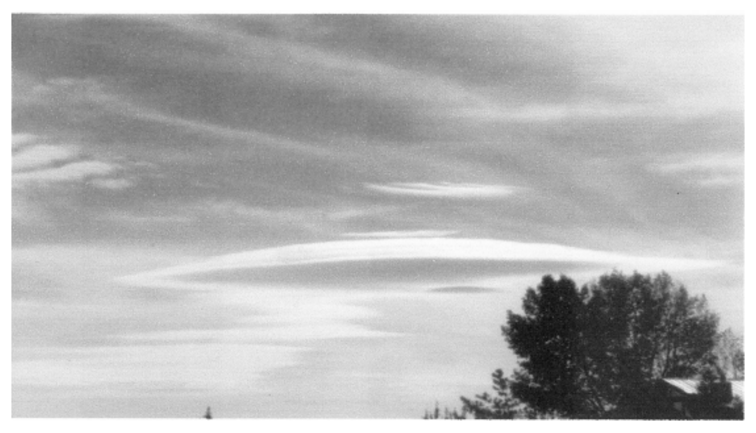
Photographed November 7th at approximately 2:15 p.m., a few blocks from Crystal's home and center.